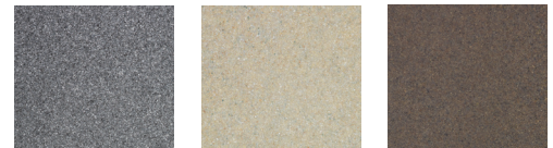
GrayStone CobbleStone BrownStone